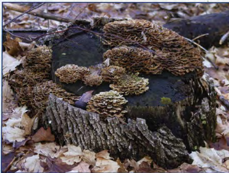
Figure 2. Sap rot decay organisms will also rot heartwood and are important in the breakdown of wood after the tree has died.