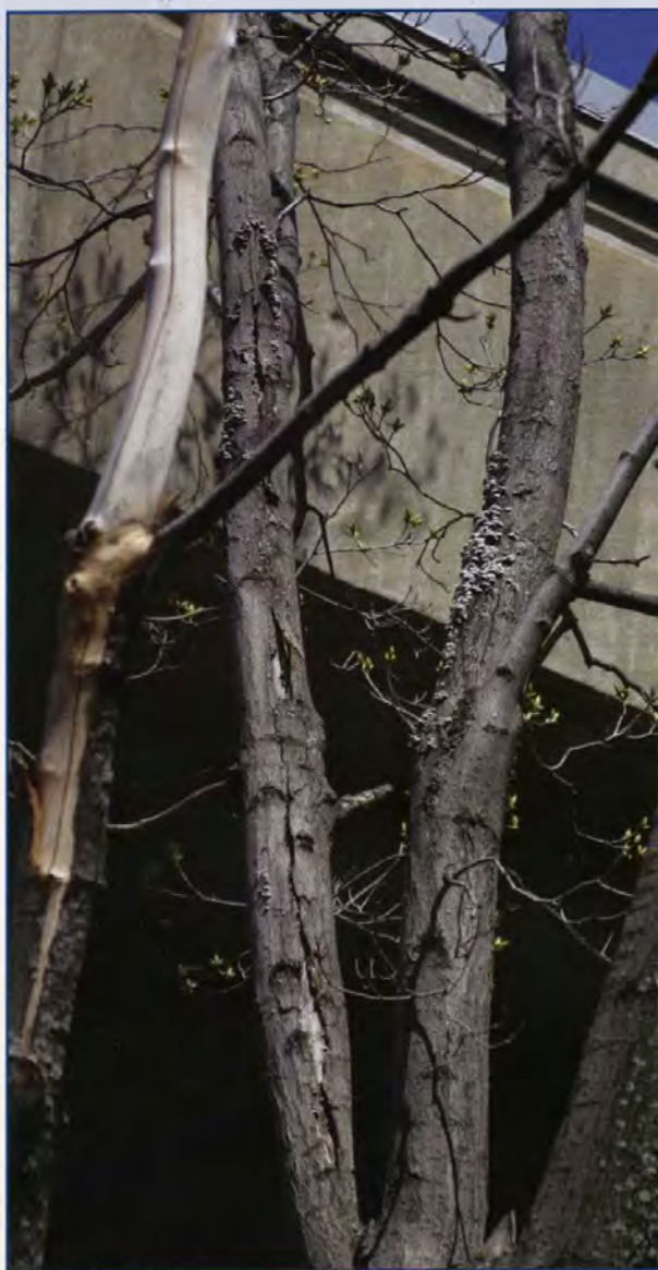
Figure 3. Sap rot fungi often invade stems after the bark and cambium have died from other causes such as sunscald on this sugar maple ( Acer Saccharum ). Some of these fungi can also kill bark and cambium after they are established in dead tissues.

The third niche of sap rots is when the tree dies but remains standing. Here, fungi quickly invades and decays standing, dead trees. On dead or nearly dead trees sap rot fungi can even decay a substantial portion of large stems in a growing season or two, depending on the tree species present. If the sap rot or heart rot was established before the tree died, decay may be extensive in larger branches or the trunk even if the tree died only recently. Some tree species, such as birch ( Betula spp.), poplars ( Populus spp.)