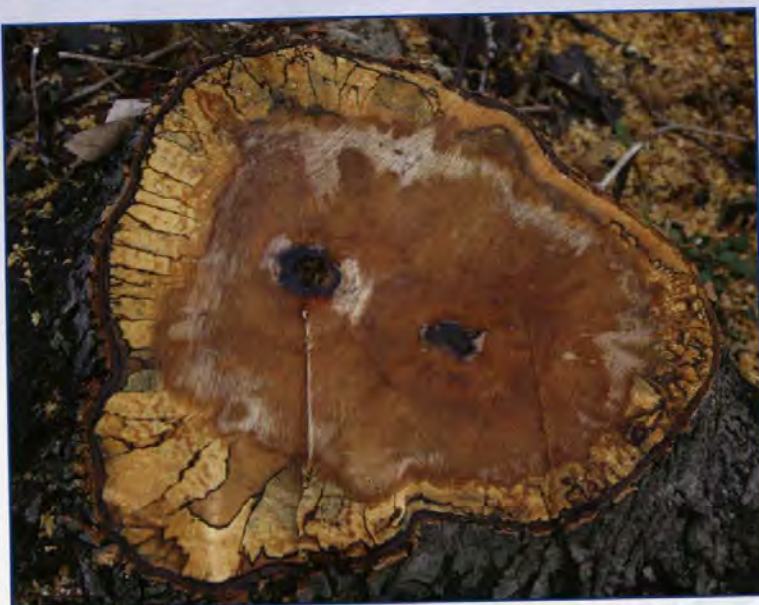
Figure 7. Sap rot typically reduces the diameter of sound wood by decaying the stem from the outside in. This greatly reduces the strength of the stem when compared to the original diameter.

When felling trees with heart or sap rot, one should use a thicker hinge than if no decay were present. Assuming the notch depth should be 20% of the trunk diameter, with sap rot, the outer fibers on either side of the hinge would not provide any strength; so the hinge should always be thicker than normal if sap rot is present. It would be hard to calculate the exact increase in hinge thickness for any of these situations because other factors (tree species, lean, wind, felling direction) also influence hinge thickness. If some part of the hinge is decayed (either from sap or heart rot), the amount of decay should be estimated and the hinge should be made thicker to compensate. If possible, the hinge should be made higher or lower in the tree to avoid areas with sap rot. In the end, it's safer if the tree remains standing as opposed to failing unexpectedly.