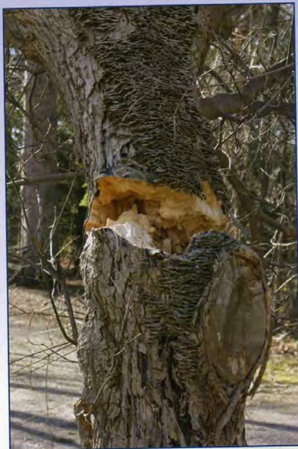
Figure 5. Sap rot fungi and decay lead to the premature breakage of stems and branches and can be important to arborists working in trees because they can dramatically reduce the working strength of wood.

on dead tissues. Several sap rot fungi are more common, such as Schizophyllum commune , Trametes versicolor , Irpex lacteus and Cerrrena unicolor . In most cases, it is not necessary to identify the fungus down to species level. On the other hand, being aware of fungi goes a long way in identifying the type of decay and the potential implications to the stability of the stem and branches.