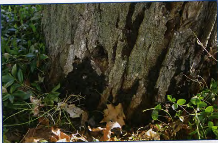
Figure 8. Decay fungi such as Kretzschmaria deusta attack living trees but can also make the entire tree unstable by decaying sapwood after the tree has died. The contact of wood with soil provides moisture conditions that are conducive to rapid decay of the base of a dead tree.

There are no "standard" tests to evaluate a branch or stem that has or might have sap rot. Probably, the best practical