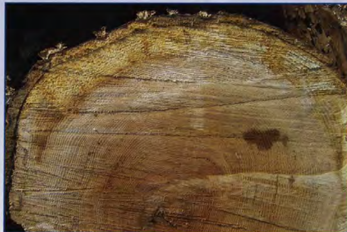
Figure 1. Sapwood decay organisms invade trees after the bark and cambium have died. The decay proceeds from outside the stem toward the center.

Sap rot is somewhat of a misnomer because most sap rot fungi are able to decay the heartwood of a tree once the sapwood has been rotted (Figure 2). However, sap rot decay will be considerably slower when fungi reaches heartwood that has inherent decay resistance. This may occur in trees such as white oak ( Quercus spp.), black locust ( Robinia pseudoacacia ), and red cedar ( Juniperus virginiana ), among others.