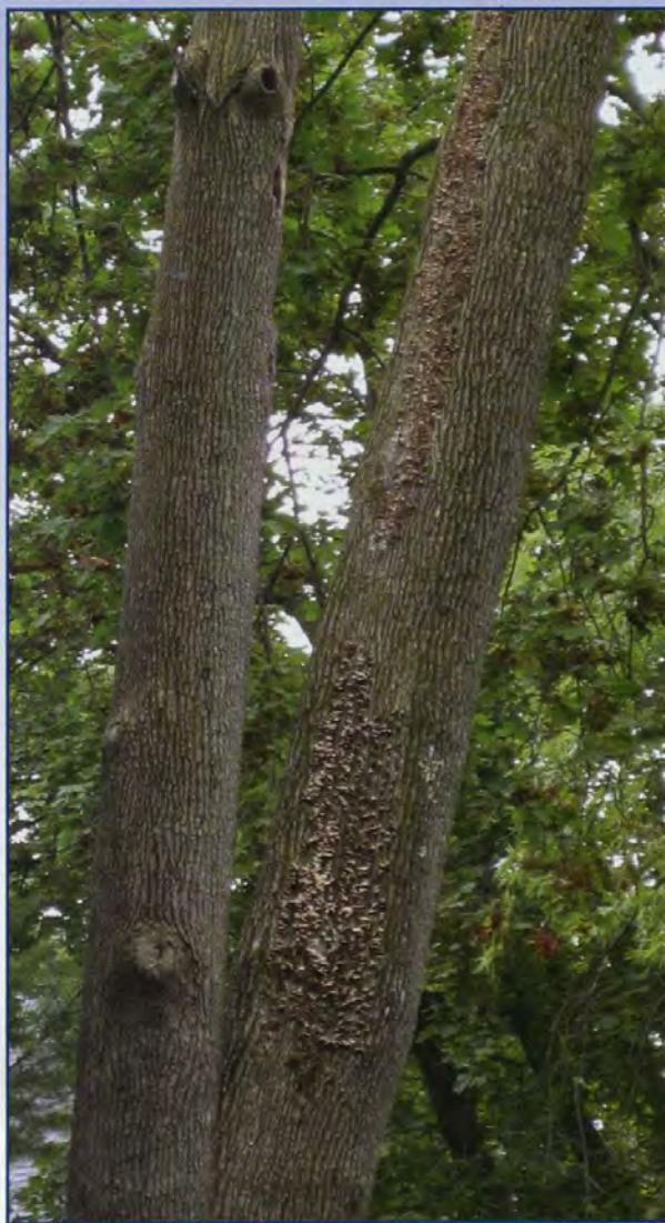
Figure 4. Sap rot fungi can contribute to the further decline of weakened trees. One way to determine sap rot's presence is by the development of small, numerous fruiting structures on the bark of dead tissues.

like cottonwood and aspen, maple ( Acer spp.), beech ( Fagus spp.), and most of the conifers, are more prone to rapid invasion by sap rot fungi after they die (Figure 5).