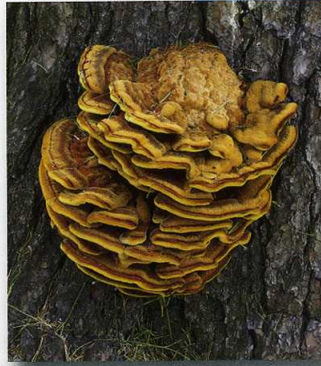
Good risk assessment will not miss the signs of root rot that should put this white pine on the removal list despite its “normal” appearing foliage. The tree is infected with a root and butt rot pathogen as evidenced by the fruiting body.

FALSE! Many utilities are realizing that the majority